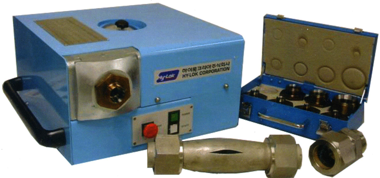
EZY- MAT II Hy-Lok's Auto Pre-swaging and Flaring machine